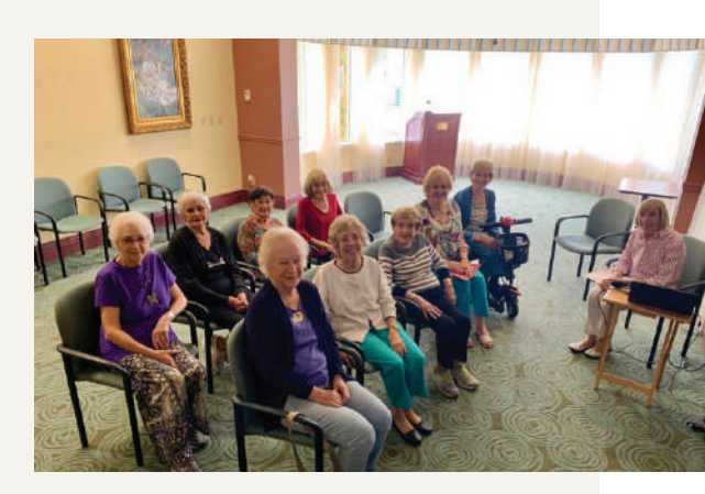
Abbey Delray South, Delray Beach, FL

During the height of the Covid-19 pandemic, Abbey Delray South approved a request from their chaplain to purchase a curriculum and facilitate conversations based on TED talks. These sessions focused on combating loneliness and promoting good communication among residents. They provided valuable insights and support during a challenging time.