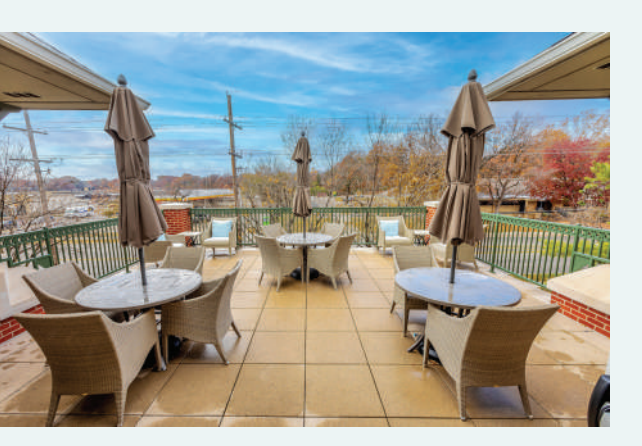
Claridge Court, Prairie Village, KS