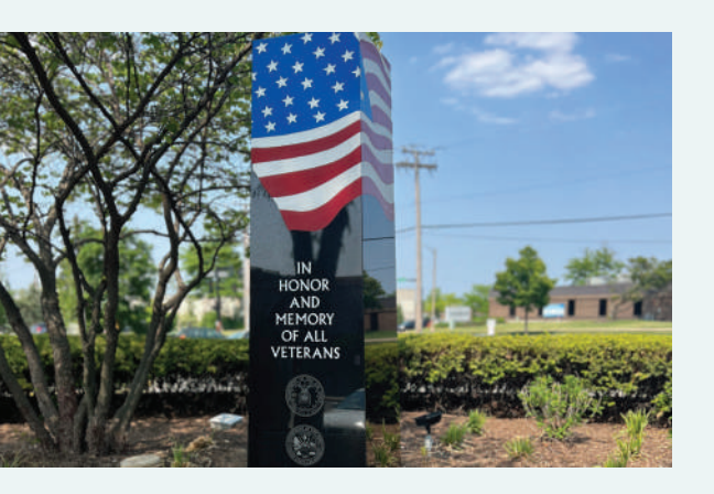
Beacon Hill, Lombard, IL