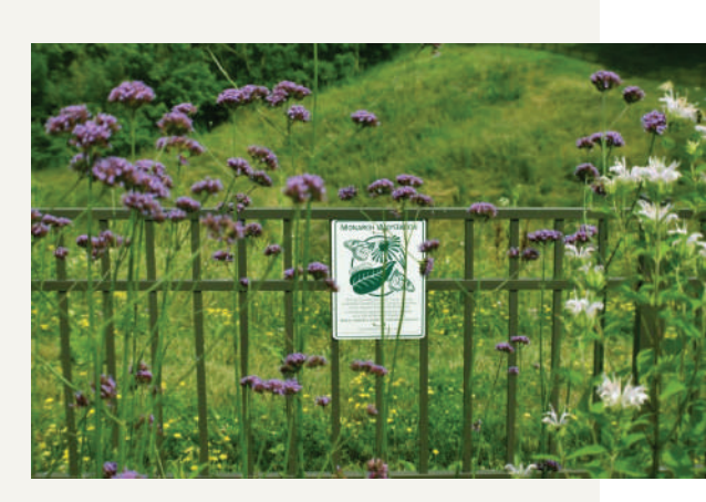
Friendship Village of South Hills, Upper St. Clair, PA

Friendship Village of South Hills transformed their community when they completed their landscape beautification project. The project included a gorgeous butterfly garden, gazebo, and bocce ball court.