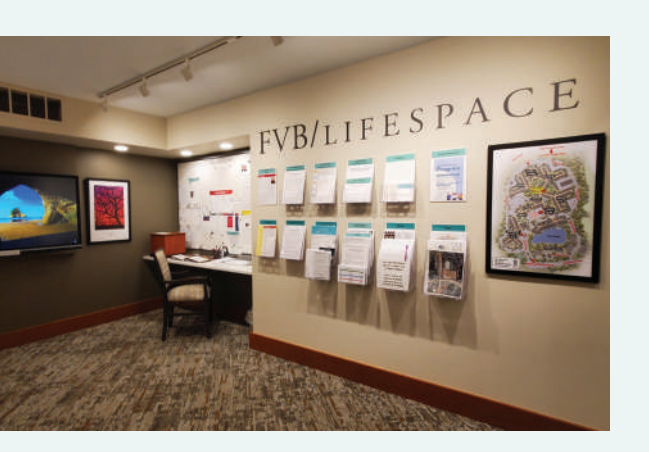
Friendship Village of Bloomington, Bloomington, MN